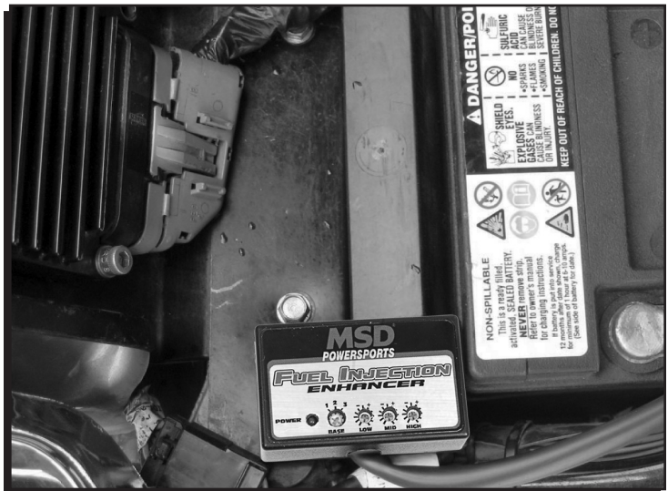
Figure 6 Mounting the Enhancer.