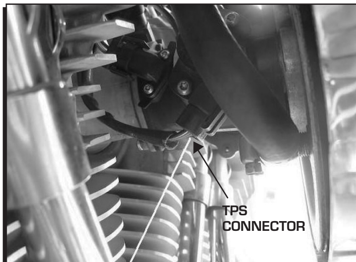
Figure 3 Throttle Position Sensor.