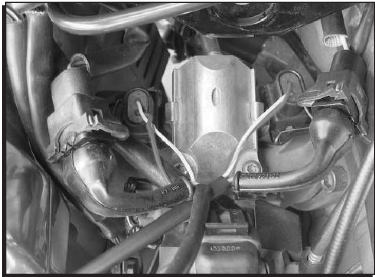
Figure 2 Injector Connections.