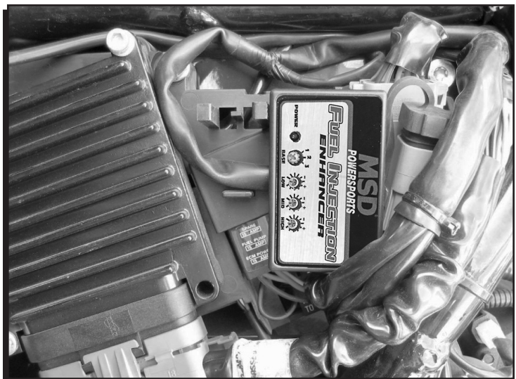
Figure 6 Mounting the Enhancer.