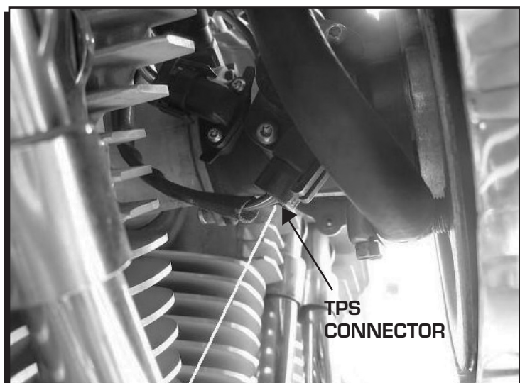
Figure 3 Throttle Position Sensor.