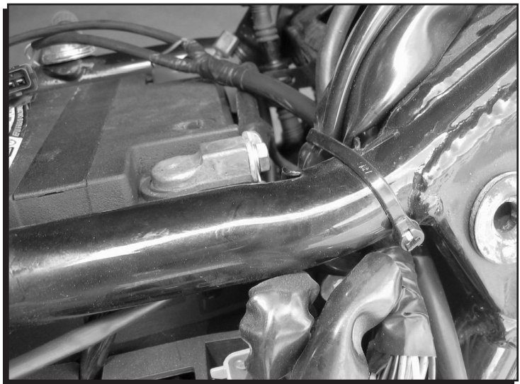
Figure 5 Secure the Harness.