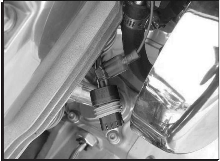
Figure 4 TPS Connection.