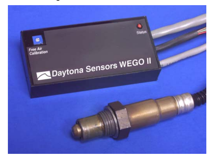
Figure 2 - WEGO II NB Unit

After installation, the WEGO II system requires free air calibration. This should be done with the sensor dangling in free air. The environment must be free of hydrocarbon vapors. We suggest that you perform the free air calibration outdoors. Turn the free air adjustment trimpot on the WEGO II full counterclockwise. Turn on power and wait until the LED stops blinking at a slow rate. Wait an additional 30 seconds for the system to fully stabilize. Then slowly turn the free air calibration trimpot clockwise until the LED starts flashing at a rapid rate. Try to set the trimpot at the point where the LED just starts to flash.