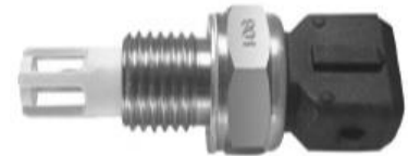
Fiat Nº 75.479.76, MTE-5053 ou IG901

It must be connected along with a FuelTech ECU to operate properly.