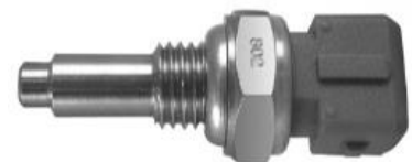
Fiat Nº 026.906.161.12, MTE-4053 ou IG802

It must be connected along with a FuelTech ECU to operate properly.